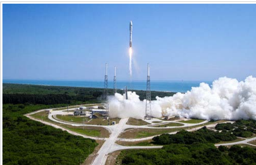
The Atlas V lifts off in the opening seconds of its launch window on Wednesday, May 20.