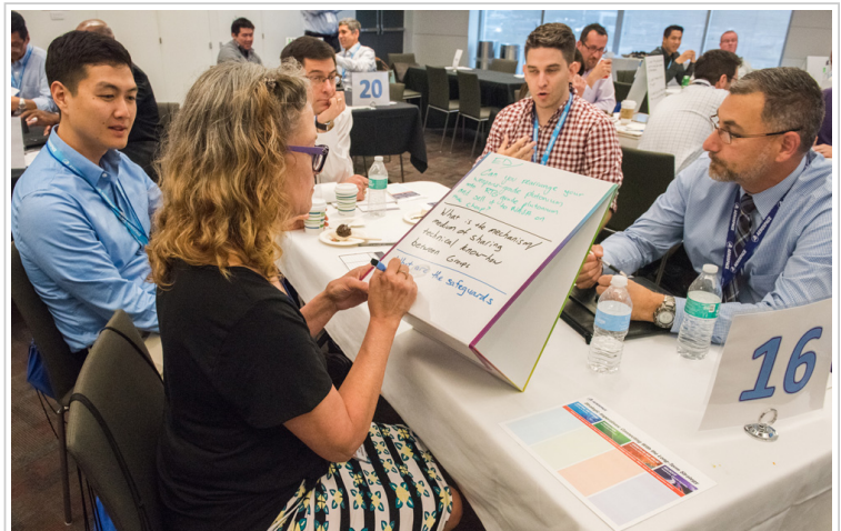
Participants in the immersion program devise questions to ask a panel of corporate executives.

To address this need, the company has kicked off a new two-day immersion program for new employees. The first session was held July 17 and 18 in El Segundo. The immersion program is planned to be held every quarter for employees hired within the previous three months. The inaugural July program was for new hires from April, May, and June. The next session will be in October for new hires from July through September.