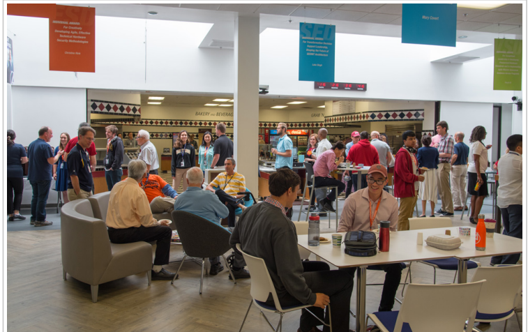
D8 employees turned out for a social and collaboration event on Wednesday, June 27.

More engagement events are planned for D8 and in other areas of the company.