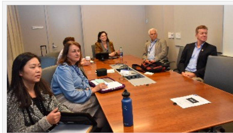
One Aerospace Site Council team members at the kick-off meeting in Chantilly.